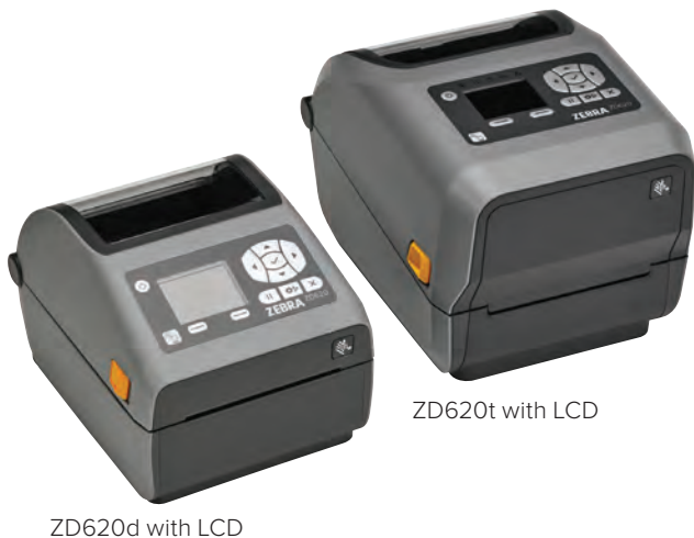
ZD620d with LCD

When print quality, productivity, application flexibility and management simplicity matter, the Zebra ZD620 delivers. As the next generation in Zebra's desktop printer line, the ZD620 replaces Zebra's popular GX Series and ZD500 printers, rising above conventional desktop printers with premium print quality and state of the art features. Available in both direct thermal and thermal transfer models, as well as healthcare-specific models, the ZD620 meets a wide variety of application requirements. It offers the most standard features of any Zebra desktop printer, including an optional 10-button user interface with a color LCD that takes all the guesswork out of printer setup and status. The ZD620 runs Link-OS® and is supported by our powerful Print DNA suite of applications, utilities and developer tools that deliver a superior printing experience through better performance, simplified remote manageability and easier integration. The Zebra ZD620 — delivering the print speed, print quality and printer manageability you need to keep your operations moving forward.