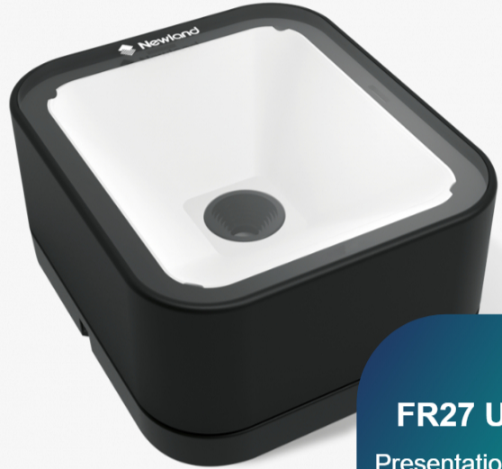
FR27 Urchin Presentation Scanners