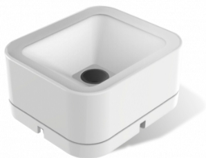
Available in white on request

Mindful that the FR27 Urchin can suit access control and kiosk applications, its case has a design that allows you to manipulate the cable for mounting portrait or landscape. It also has threaded fixing points for vertical mounting.